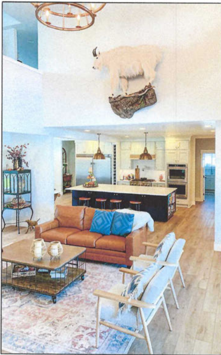
The 5,000+ square foot home has the scale to accommodate this mountain goat (temporarily on loan from a relative) above the open living area. Pale floors and whisper-soft gray wall color, plus large glass patio doors to the right, add to the airy, light tone of the main level.